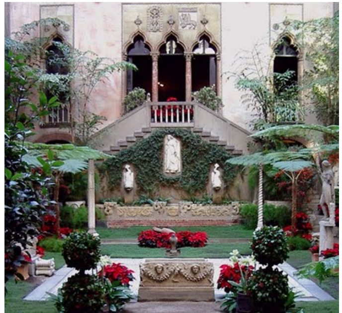
Gardner Museum Courtyard